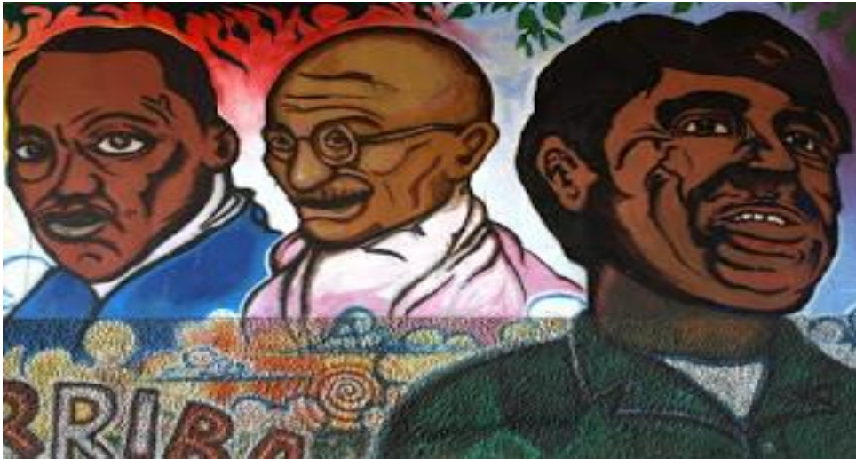
King, Gandhi, Chavez/ Barrio Logan Mural, Cesar Chavez Parkway-San Diego, CA

GANDHI IN THE MODERN WORLD: FROM CIVIL RIGHTS TO THE ARAB SPRING