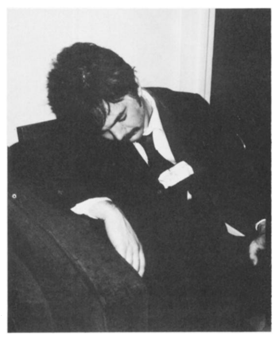
The couple feed cake to each Old "grandfather" takes a nap other

protection of the play frame and simulated wedding frame, in words, gestures, conversational style, and dress, in reversals of "real-life" roles and manners, one saw everyday departmental politics as a "projective system."