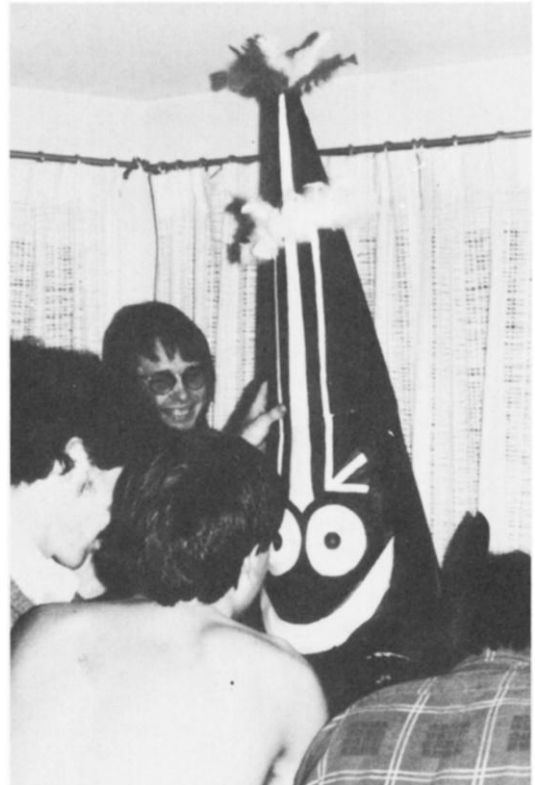
The "owner" of the Tubuan concealed in the costume