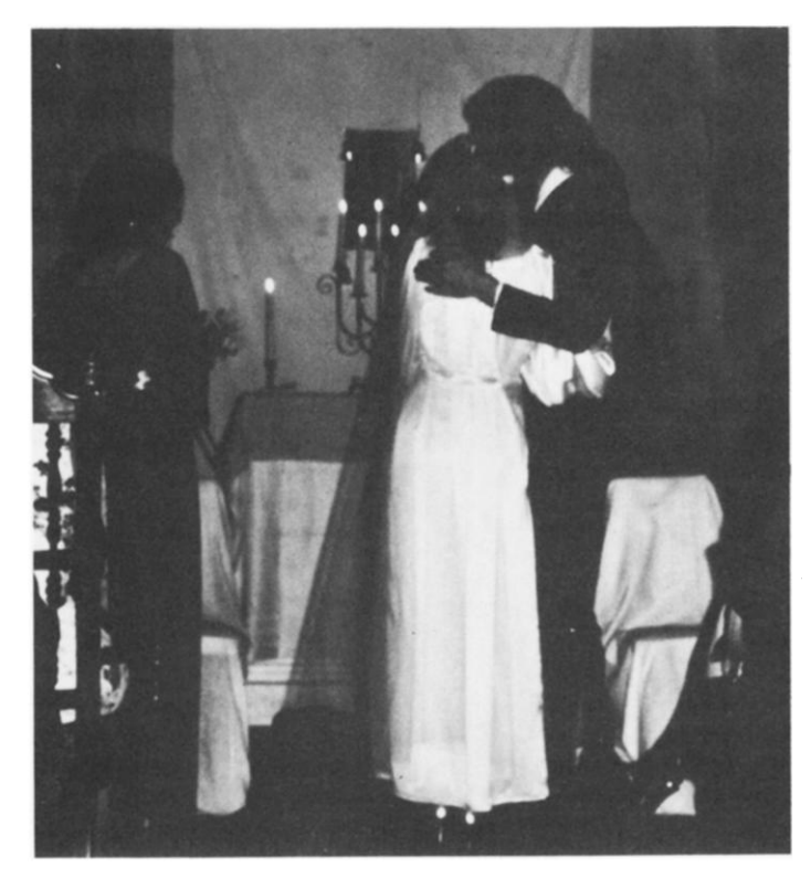
The couple embrace at the "alter"